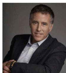
Christopher Lawford Author of Moments of Clarity Son of Peter Lawford