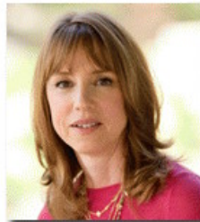
Lisa See NY Times Best Selling Author of Shanghai Girls