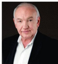
Joseph Kanon Award Winning Author of Stardust