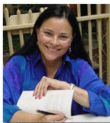
Diana Gabaldon NY Times Best Selling Author of An Echo in the Bone