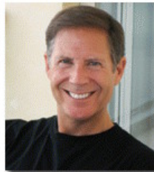
Christopher Reich NY Times Best Selling Author of Rules of Vengeance